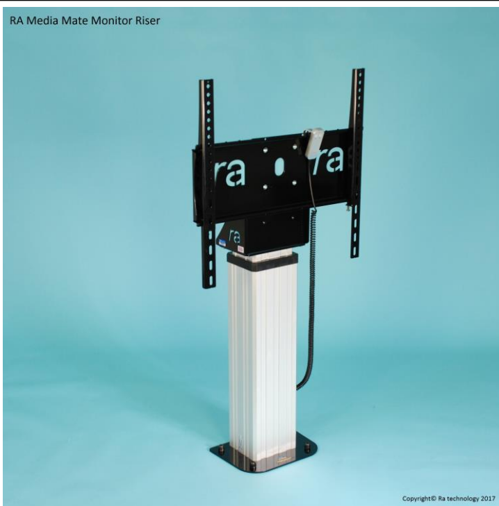
RA Media Mate Monitor Riser

Electric Height Adjustable Wall / Floor Riser and Mobile Trolley for Interactive Screens